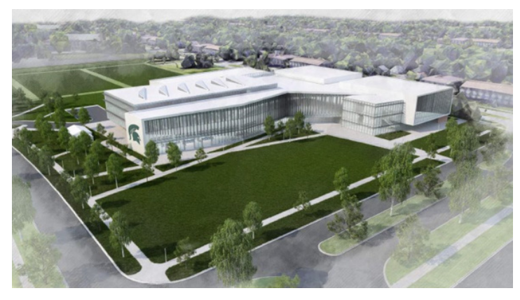
Proposed Rendering of New Rec Center

The main rec center in the middle of campus will be replaced with a new Health, Wellness and Fitness Center. A conceptual rendering can be seen on the right. Construction is expected to take several years and is funded primarily through a new student recreational activity fee.